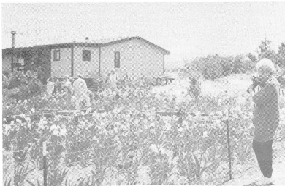
Admiring the contrast between the picturesque arid landscape and luscious iris flowers at Anita Condon's garden.