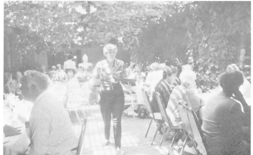
Lunching under the arbor