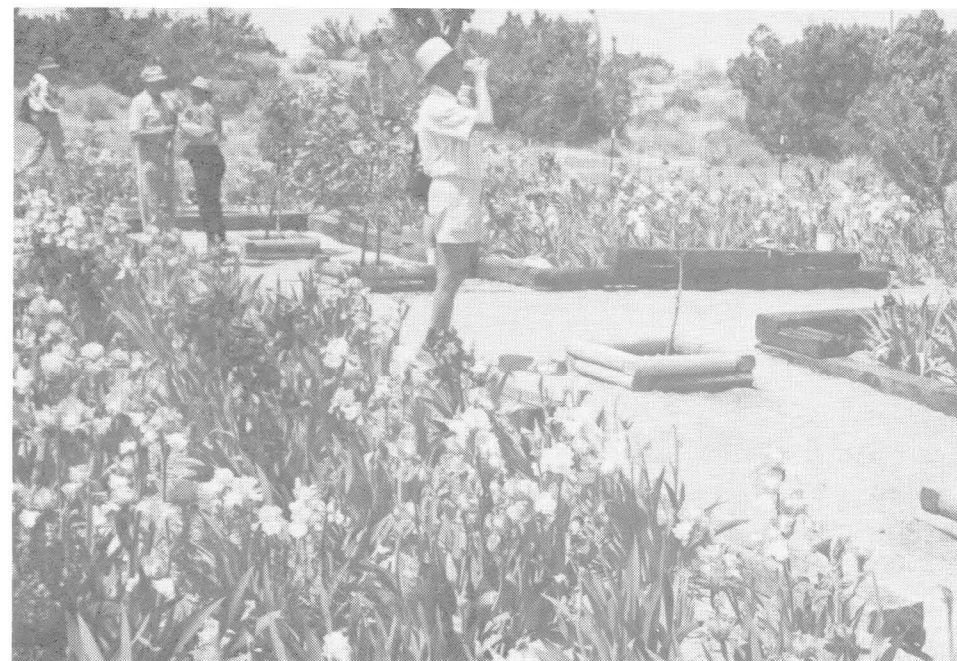
Norm Allen enjoys a cool drink amidst an array of bloom.